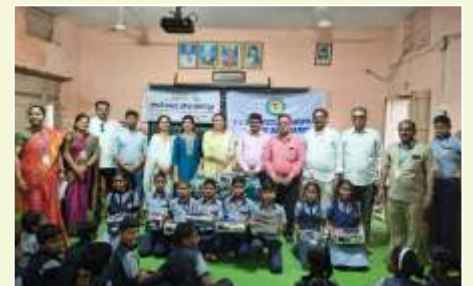
Shoes donation at Kuchan High School