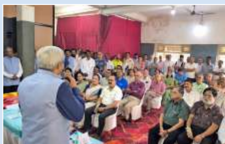
DG 2026-27 Office Opening