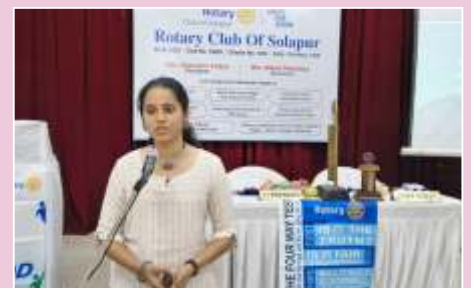
Seminar on Preventive Health for Women