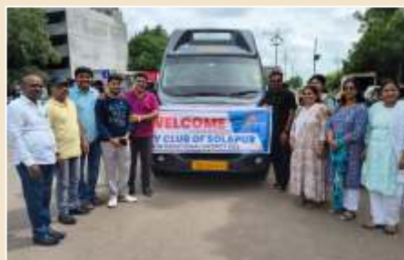
Team Solapur Bus