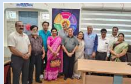
Dignitaries at DG 2026-27 Office Opening