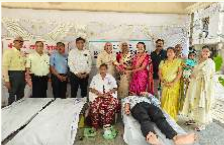
Blood Donation Camp at Chandak Bagicha