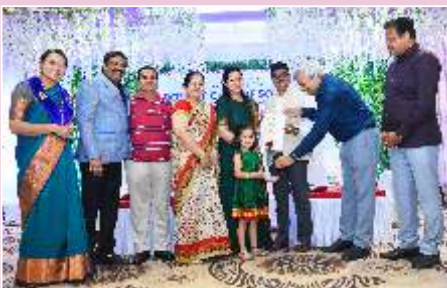
Future Rotarian in Making