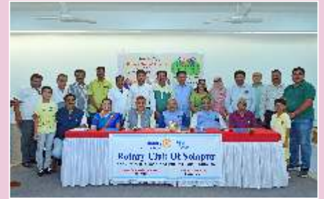
RC Solapur New Members at the orientation