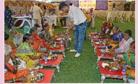
Shahi Bhoj for beneficiaries