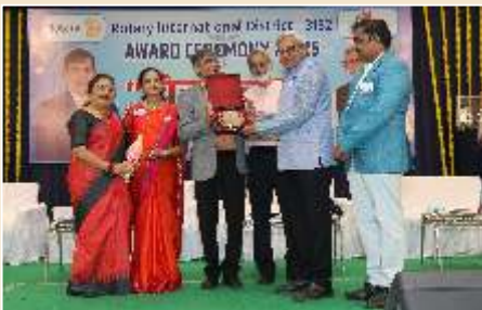
CSR Felicitation P P Patel & Co