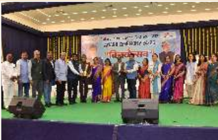
Best Managed Rotary Club Trust