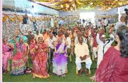
Fun filled moments for beneficiaries