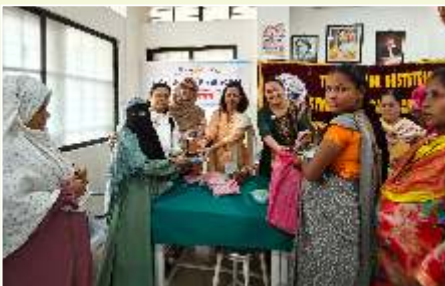
Distribution of Protein Powder and Nutritional Supplements to expectant and new mothers at Dufferin Hospital