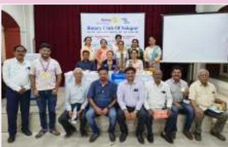
Weekly Meeting 5