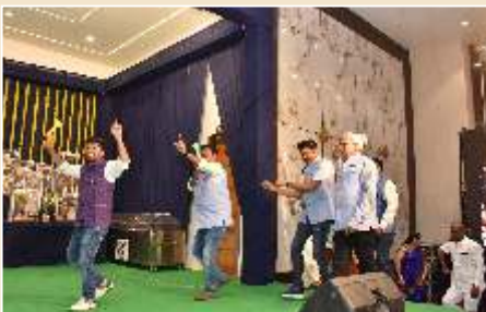
Enjoyment for collecting awards