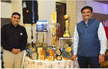
Dynamic Duo with 30+ Awards