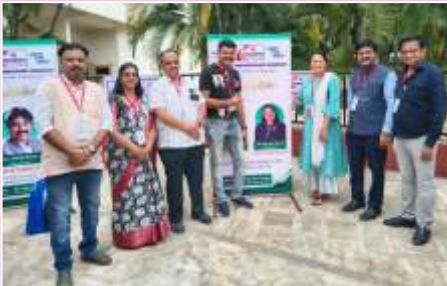
Having a good time at the district seminar