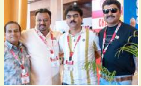
Lead 25 - Friends Forever!