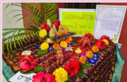
Modak Competition for Ganapati Utsav