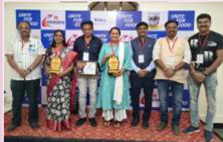
Winning Top 5 Shikhar Trophy