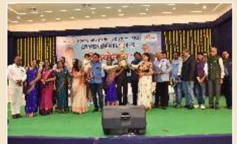
Highest Giving to TRF