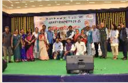
Best Administered Club in District