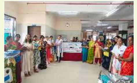
Distribution of Protein Powder and Nutritional Supplements to expectant and new mothers at Civil Hospital