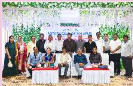
Welcome to Rotary Club of Solapur Family!