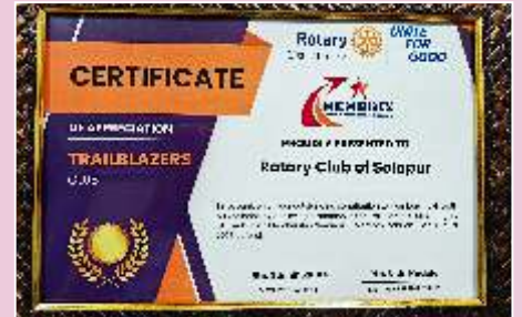
Recognition for membership growth