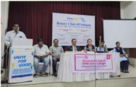
Charter Presentation and Installation of Rotaract Club of DHB Soni College