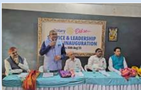
District Service and Leadership Centre