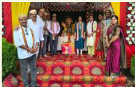
Rotary members at Ganapati Arati at Kuchan High School